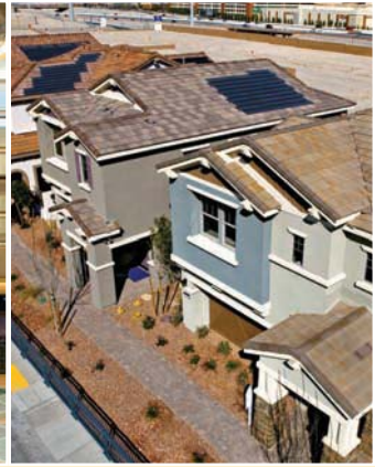
Villa Trieste A Pulte housing development, is the largest residential community in the country to achieve LEED® certification at the Platinum level.