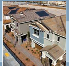
Villa Trieste , a Pulte housing development, is the largest residential community in the country to achieve LEED® certification at the Platinum level.

For the last 34 years New Horizons Academy has been the only K-12 school in the State of Nevada to meet the needs of students with learning differences such as central auditory processing disorders, sensory processing confusion, motor difficulties, attention deficit disorders (ADD/ADHD), lack of language and pragmatic skills and other multi-sensory processing difficulties.