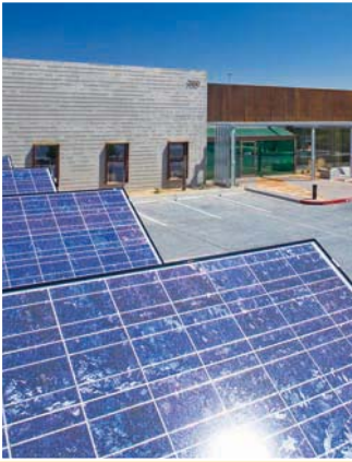
CORE Office Building (Seeking LEED® Gold NC)