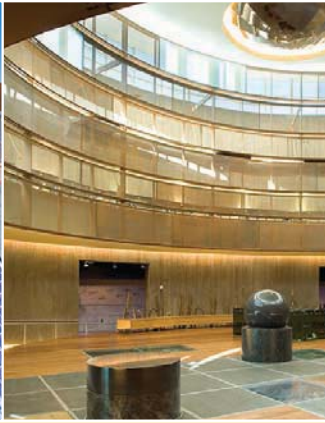
Las Vegas Springs Preserve (LEED® Platinum NC Certified)