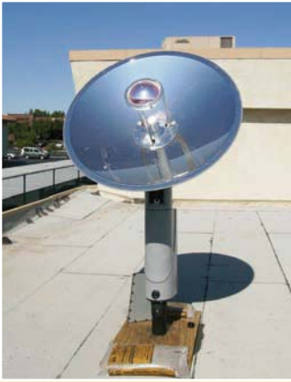
New Horizons Academy's roof-mounted solar collection dish donated by the Sunlight Direct Company.